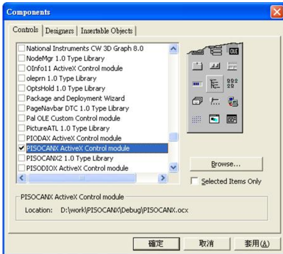
Fig 3.1 Component

Step 1: Add the ActiveX Control (OCX) into the VB toolbox. Click the “Project/Components” in Visual Basic 6.0 menu as shown in Figure 3-1.