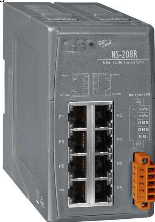
Figure 1-1 NS-208R

The NS-208R has 8 Ethernet Switching ports that support 10/100Base-T(X), with a 10/100M auto-negotiation feature and auto MDI/MDI-X function. It can connect 8 workstations and automatically switches the transmission speed (10 Mbps or 100 Mbps) for corresponding connections. The flow control mechanism is also negotiated. NS-208R is designed especially for mission critical and harsh environmental applications since it comes ready with conformal coating