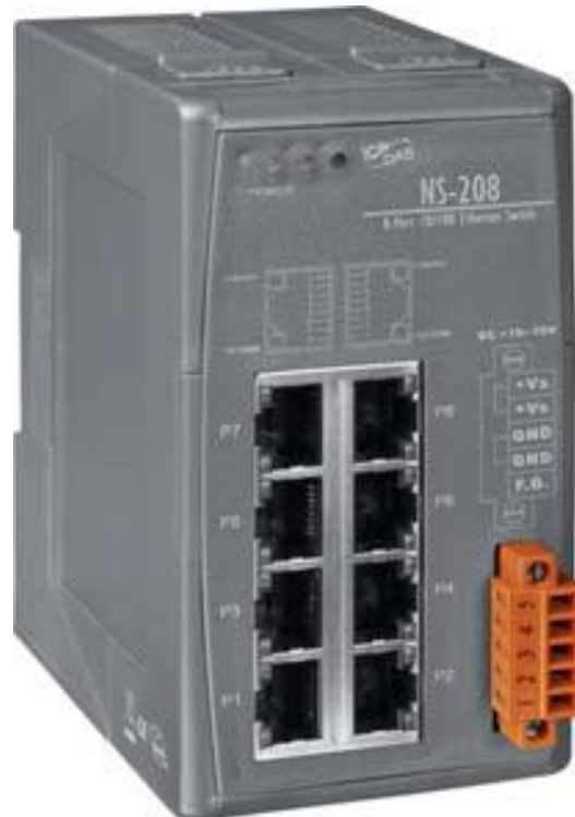
Figure 1-1 NS-208

The NSM-108/NS-208 has 8 Ethernet Switching ports that support 10/100Base-T(X), with a 10/100M auto-negotiation feature and auto MDI/MDI-X function. It can connect 8 workstations and automatically switches the transmission speed (10 Mbps or 100 Mbps) for corresponding connections. The flow control mechanism is also negotiated. LEDs embedded in RJ-45 jacks make for easy monitoring. Port connectors are shielded RJ-45. A power source for +10~+30VDC is required.