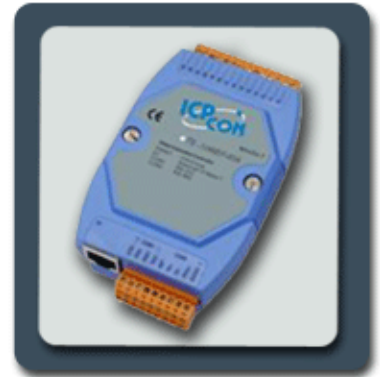
High Speed FRnet Equipped Embedded Ethernet Controller I-7188EF-016: $450