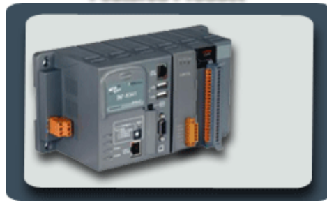
Wincon + I-8172 (2 Port FRnet Interface Module)