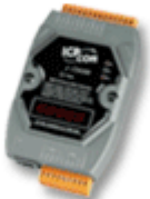
I-7243D DeviceNet Master / Modbus TCP Server Gateway