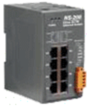
NS-208 8 Port Industrial Ethernet Switch