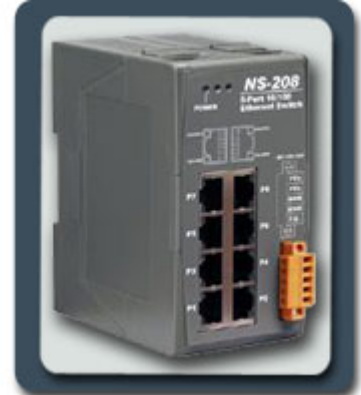
8 Port Industrial 10/100 Mbps Ethernet Switch