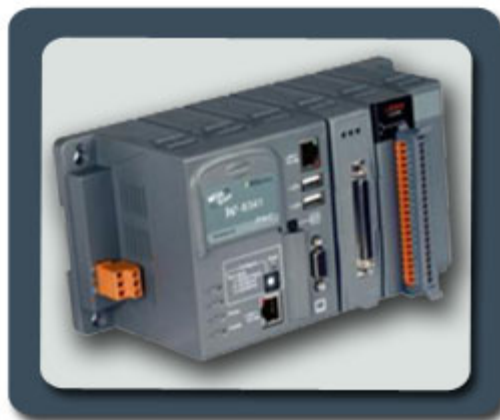
Programmable Automation Controller